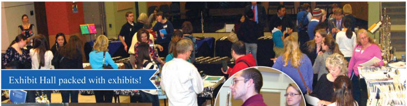
Exhibit Hall packed with exhibits!